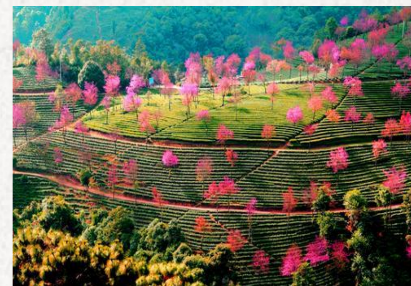
The landscape when the flowers bloom