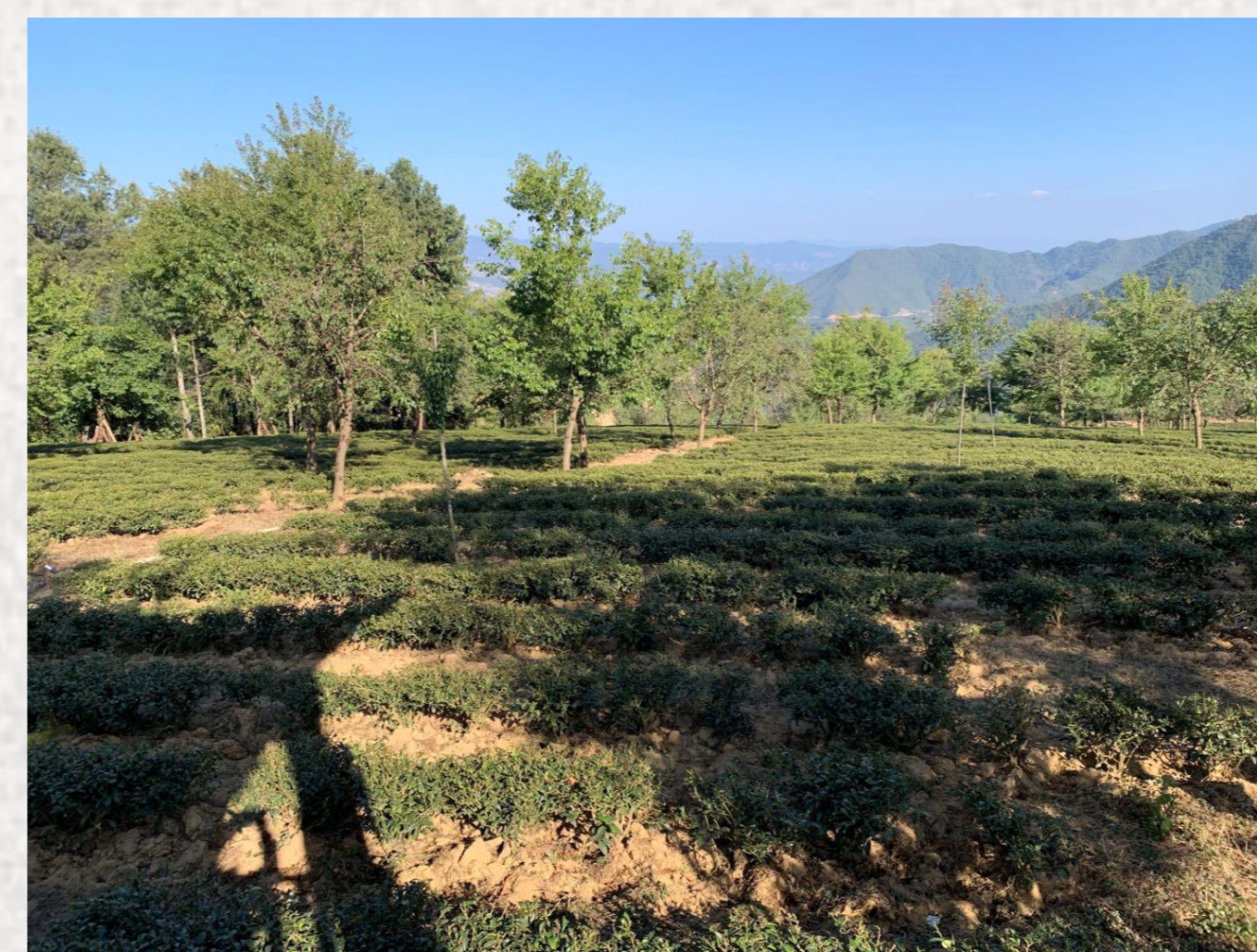
The landscape of the village beside the valley