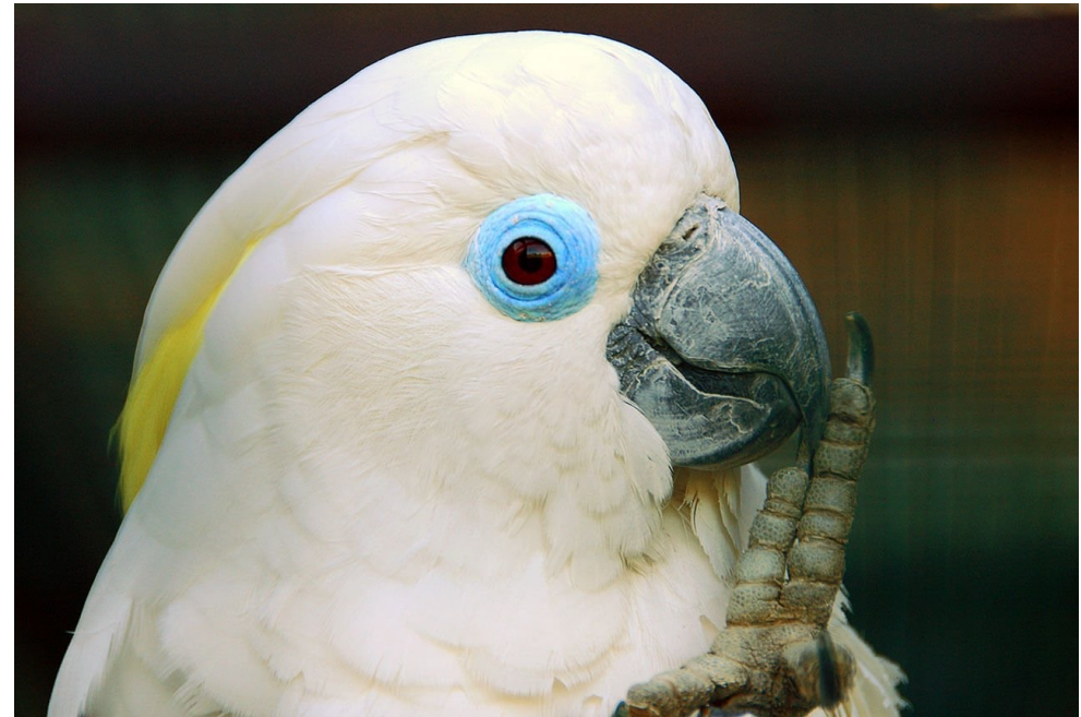
Blue-eyed Cockatoo Cacatua ophthalmica – New Britain, PNG