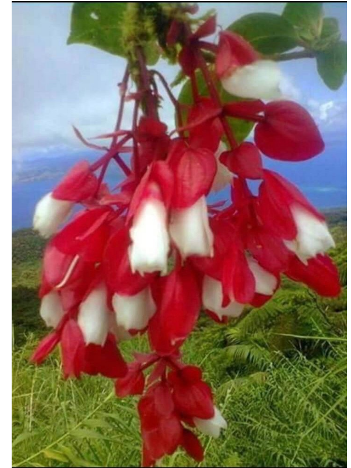
Medinilla waterhousei (Tagimoucia flower) Taveuni, Fiji