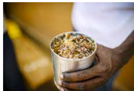
▷ A forest service head offers training in beekeeping, aimed at diversifying sources of income for farmers in Burkina Faso.

MELIA provides support for ex-ante impact assessments, which estimate the potential impact of an intervention or set of interventions. This requires clear understanding and articulation of current situations, trends and relationships and of assumptions about responses and interactions.